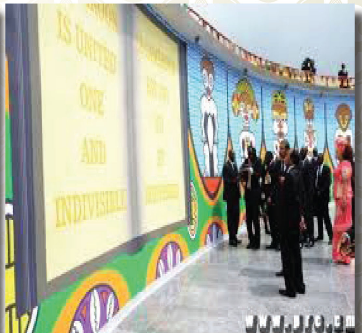
The Monument of Reunification in Buea